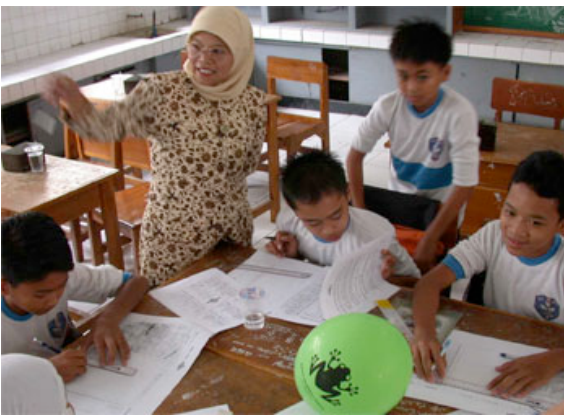
A teacher working with her students on a Green Map project in Bandung, Java, Indonesia