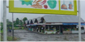
An Indonesian organic market promoted by a Green Map

locally run, globally linked communication movement was underway.