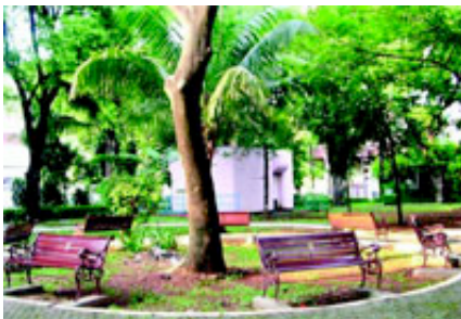
A community garden that appears on a Green Map of Jakarta

In October 1989, in the Arab Night Market, Yogyakarta, Indonesia, a captive orangutan and I locked eyes. Her long arms stretched outside the confines of a tragically tiny cage, restlessly flipping a stone up and down in her hand. I was transfixed by the sorrow in her face and wordlessly, I tried to communicate my concern. The orangutan's smooth, round stone flew toward me, and as they say, I caught the stone and "turned green."